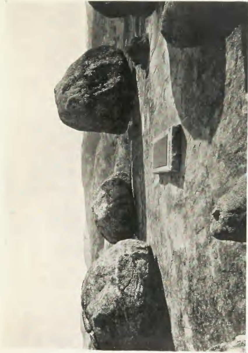
THE LONELY GRAVE IN THE MATOPPOS.