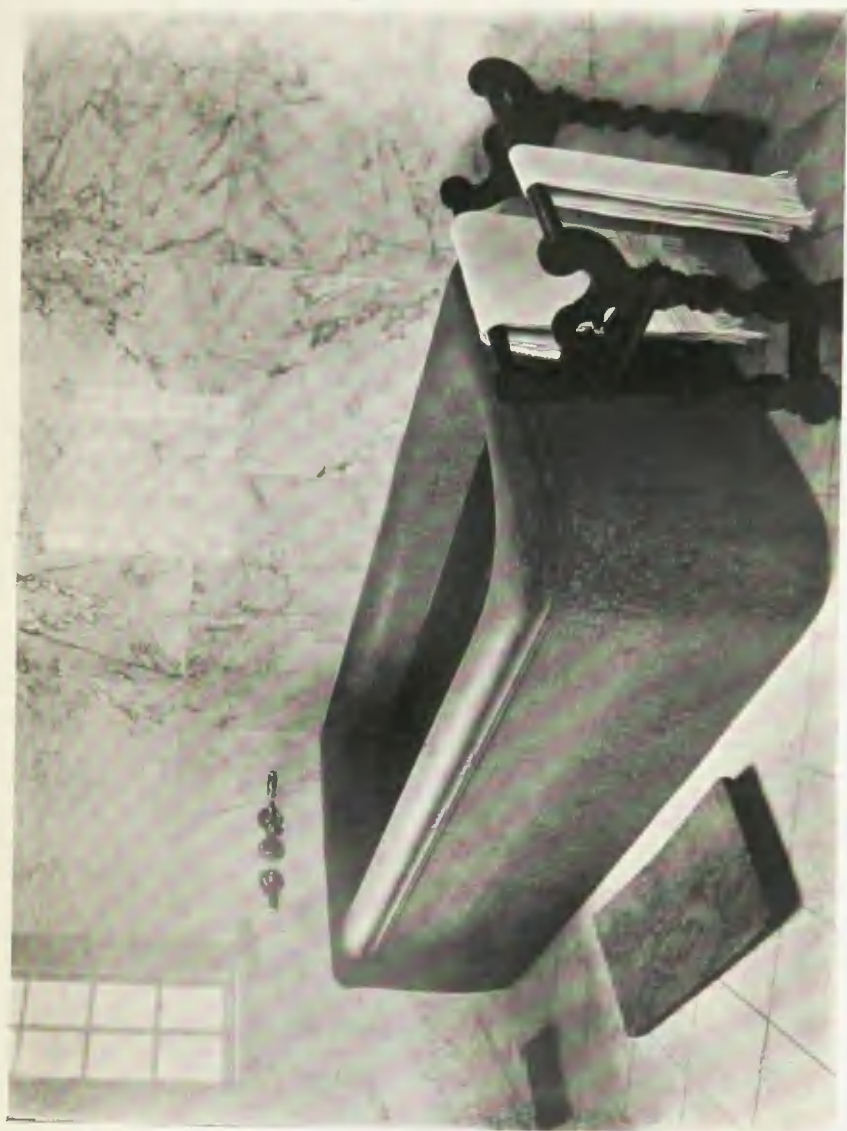
BATHROOM AT GROOTE SCHUUR.