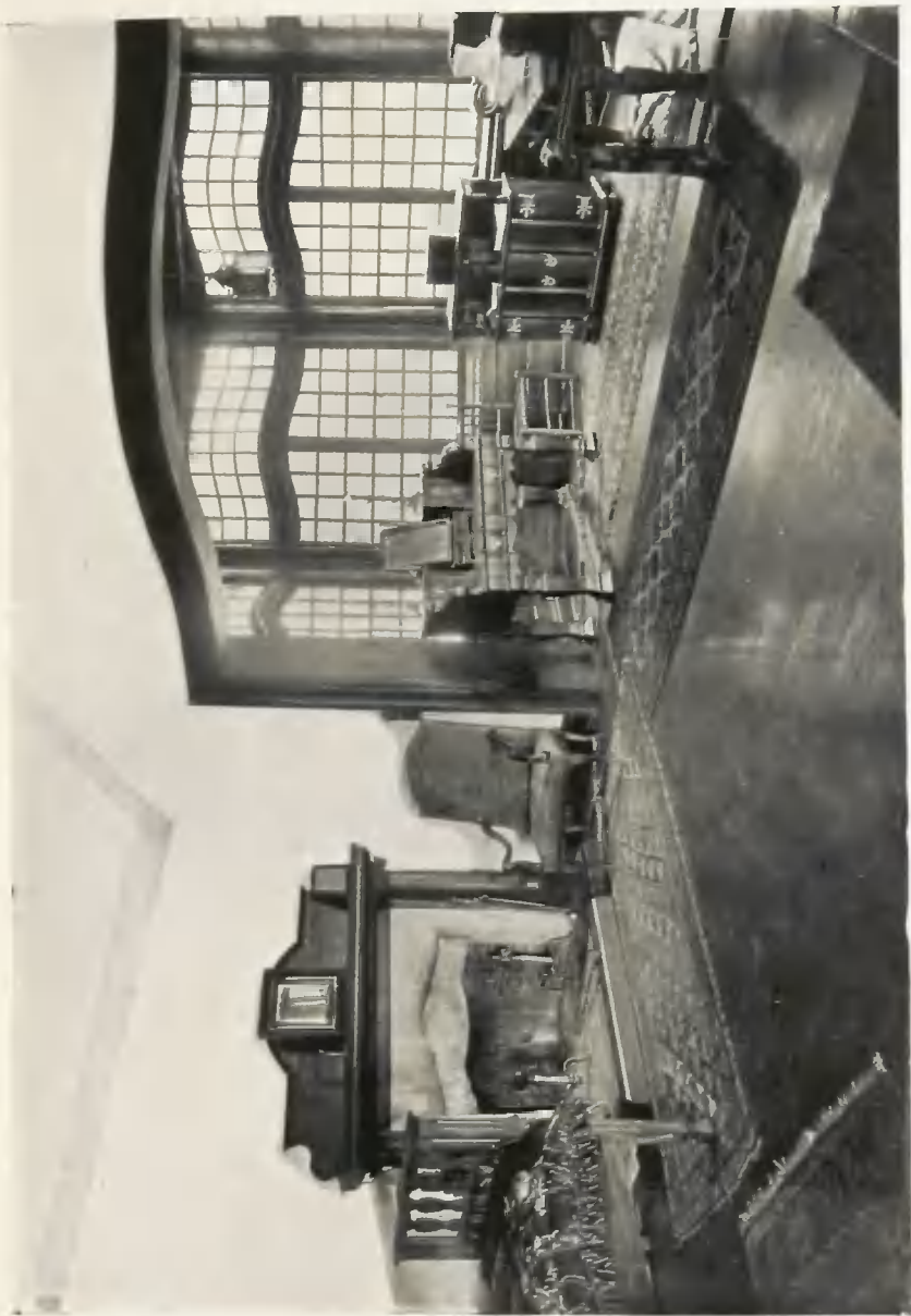
RIODES'S BEDROOM AT GROOTTE SCHUUR.