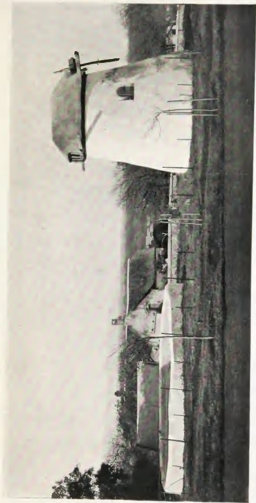
DUTCH EAST INDIA COMPANY'S MILL.